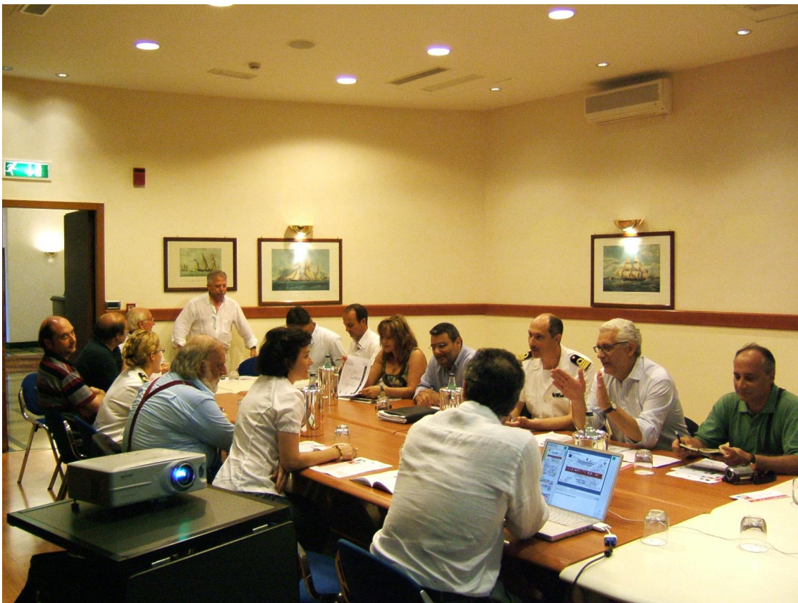
A moment in the participative process: Focus Group discussing about the Port development (July 2008)

the objectives and the different steps of the strategic planning process. Each step of the process required a growing commitment from involved stakeholders: at the beginning, a presentation event was organised, merely aimed at informing the local community about strategic planning objectives and methodology; later, representatives of institutions, trade unions and the non-profit sector were interviewed to gather information and points of view about the territory; schools were involved, too, to encourage students to actively engage in the construction of their own city and future; working groups were formed and face-to-face meetings with the relevant stakeholders were arranged to focus on the definition of shared development strategies; finally, focus groups worked on the identification of development projects, consistent with the agreed strategy.