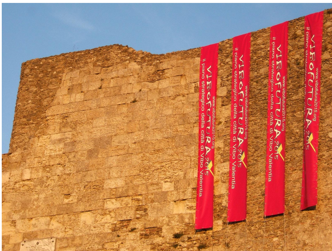
Communicating the Strategic Plan: banners on Vibo Valentia Castle's walls to promote a strategic planning meeting

The participatory process related to the strategic plan had very positive effects on the local community. It was really successful in raising awareness among the local actors about the territory's present state and about the importance of personal commitment to solve problems and trigger development. It also allowed the identification of concrete, shared and feasible development projects. Moreover, the population experienced the process as an important opportunity and as a positive sign of the administration's willingness to put itself to the test, to really "listen" to the people who live and work in the territory.