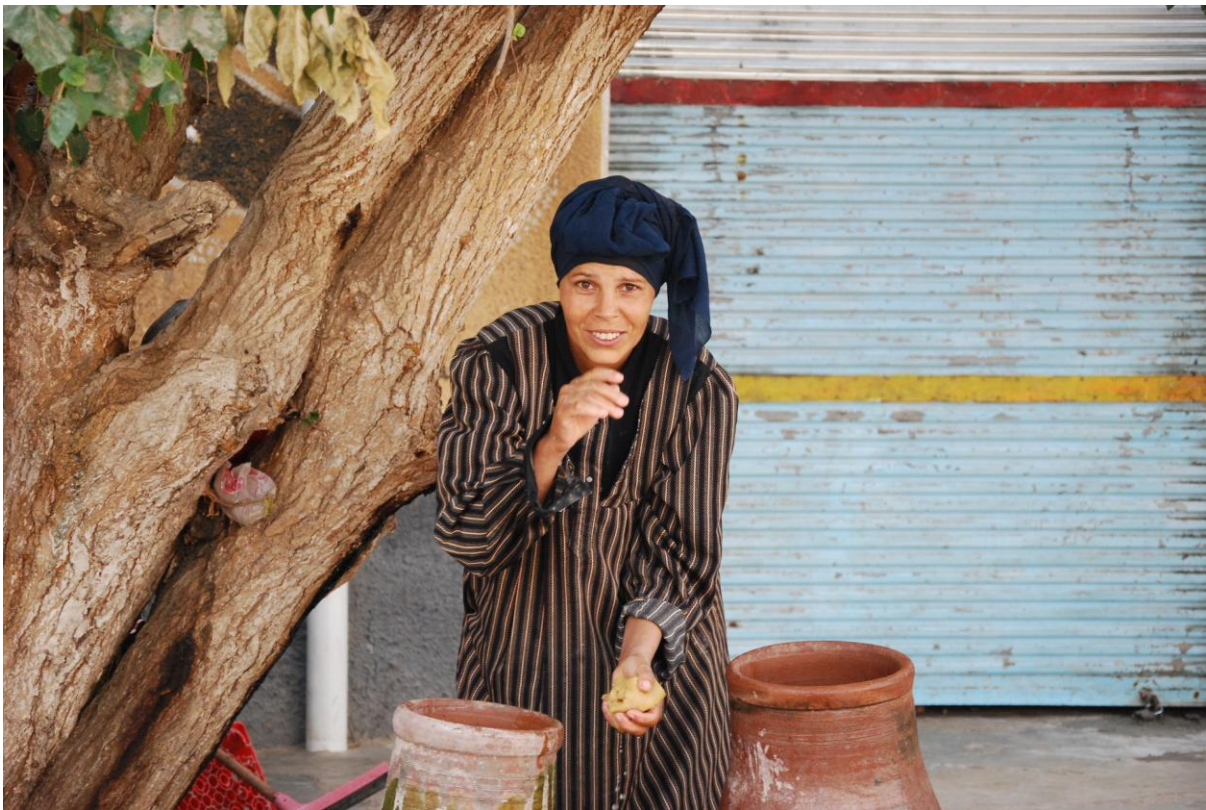
Rinsing jars, outskirts of Giza, 2009.

Some scepticism remains. No disempowering devices were adopted within this committee to guarantee that it would not be controlled by the very same actors that already monopolise the decisional power. The Local Stakeholders' Council seemed to be a formal super-structure imposed on pre-existing power relations, and it is quite conceivable that it will institutionalise them without generating any substantial modification.