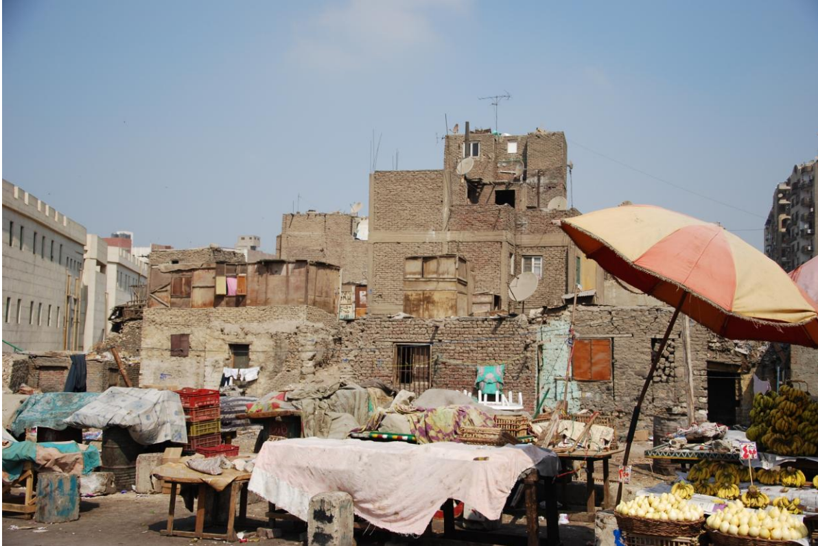
Street life, near Bab Zweyla (downtown Cairo), 2009.

Three lessons can be drawn from this experience. Firstly, for any organisation intending to promote participatory development it is necessary to reach an internal agreement on the meaning of “participation”. Without a clear definition of the aims and the nature of the approach, not only it is difficult for the team to pursue a consistent strategy, but it is also impossible to evaluate the success of the initiative in achieving its target.