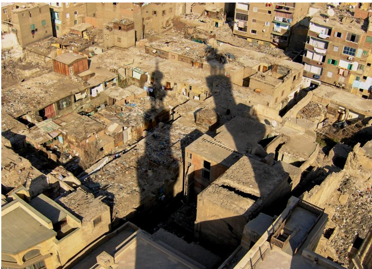
Inhabited rooftops, Islamic Cairo, 2008.

From the project documents, the importance of participation or the forms it should take are not clear. According to the Verbal Note n. 401 (24 th of August 1998), «the aim of the project is to take into consideration the needs of the citizens by carrying out urban renewal measures and/or redeveloping land for housing construction». In the Mission Paper of the Participatory Urban Management Programme, Egypt (Arab Republic of Egypt – Ministry of Planning and Federal Republic of Germany – GTZ, 1998), the «agreed purpose of the PUMP is to increase the ability of social and institutional agencies to promote participation-oriented urban development», hence «contributing to policies and mechanisms that promote positive impact on living conditions of the disadvantaged population of urban informal settlements». Finally, in “Participatory Urban Development Boulaq El-Dakroul – Project Status per October 1999”, we read that «the objective of the project is the improvement of the economic, social and environmental living conditions of the population of Boulaq El-Dakroul». The three formulations are not contradictory, but they insist on different aspects which are neither necessarily connected nor consequential and it is not clear which one was to be considered as the priority.